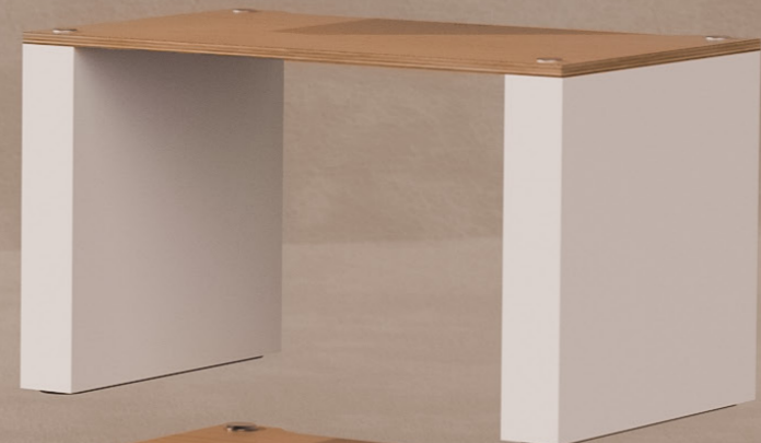
Stax 2G Shelf LP