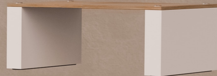
Stax 2G Shelf 220