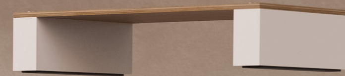
Stax 2G Shelf 120