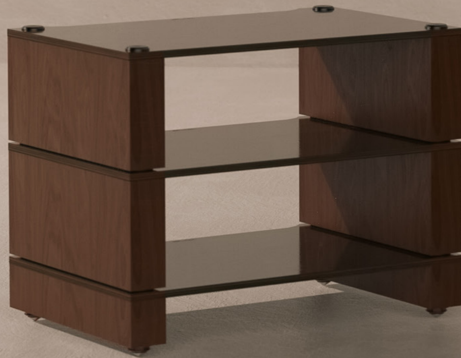
Stax 2G 4 Shelf Collection