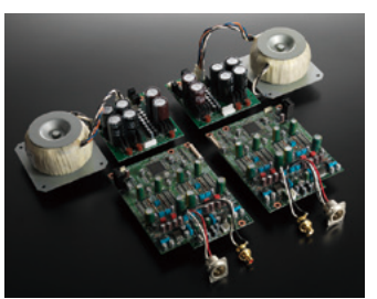
and individual power supply units

adopted, including a lowfeedback DC power supply regulator featuring a discrete circuit configuration which contributes to its powerful open sound.