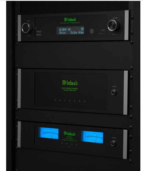
Top: MX100 A/V Processor, MI347 7-Channel Amplifier, and MI254 4-Channel Amplifier installed in AV rack.