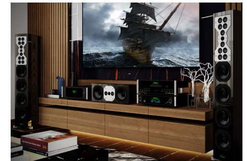
Bottom: MX100 A/V Processor, MI347 7-Channel Amplifier, MVP901 Audio Video Player, XR100 Floor Standing Speakers, and LCR80 Center Channel Speaker in a home theater. All units sold separately.