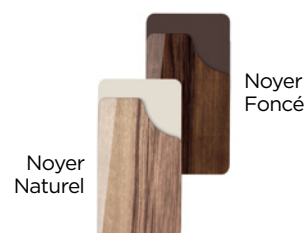
Standard Noyer finishes