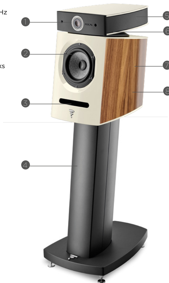
Removable tweeter and woofer grilles