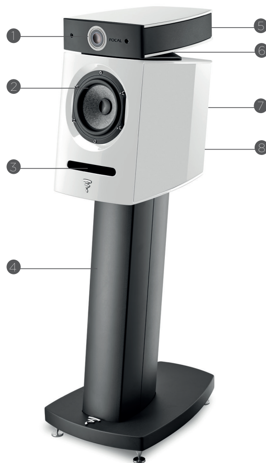
Removable tweeter and woofer grilles