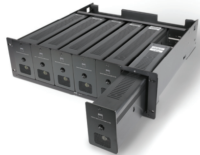
Six CI 720 mounted in RM720 rack (optional accessory)

The 60-watt per channel, single-zone CI 720 Network Stereo Zone Amplifier with HybridDigital™ amplification technology is the perfect addition to today's most advanced custom home audio systems. Featuring 60 watts per channel, and powered by BluOS™, the advanced music management operating system, the CI 720 allows you to access and stream 24-bit high-res music with the control of a smartphone or tablet via Ethernet and third-party control systems like Control4, Crestron, RTI and URC.