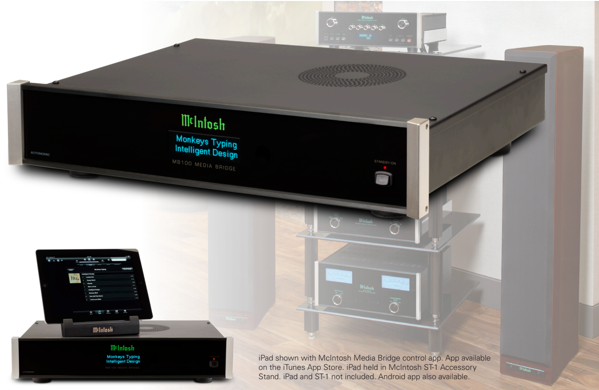
iPad shown with McIntosh Media Bridge control app. App available on the iTunes App Store. iPad held in McIntosh ST-1 Accessory Stand. iPad and ST-1 not included. Android app also available.