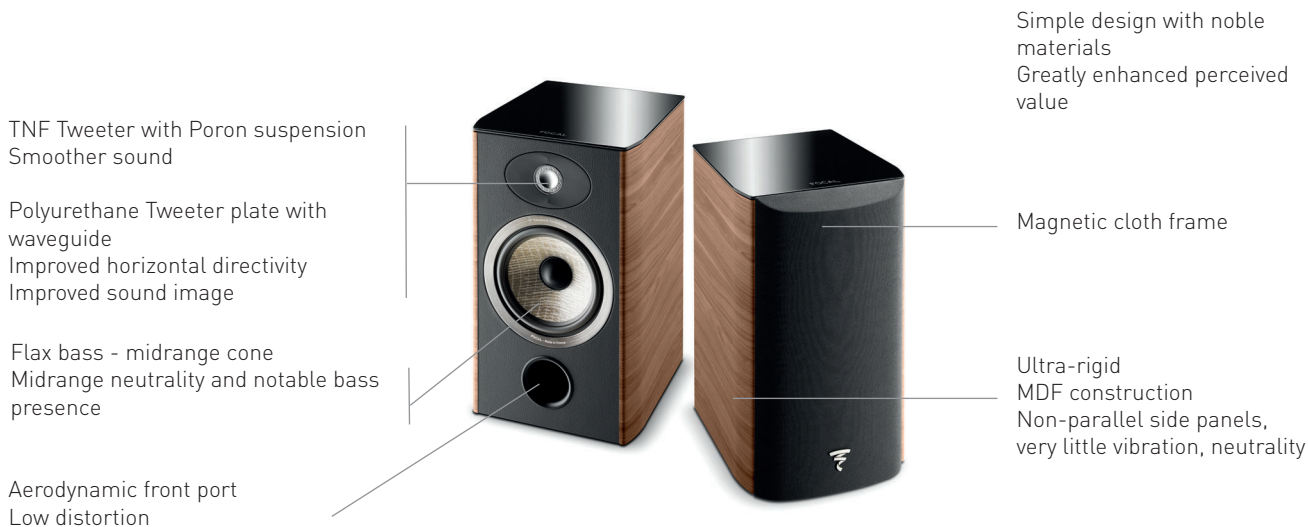
Aria 906 Walnut

The Aria 906 bookshelf loudspeaker is faithful to the DNA of the Aria range: refined high-end acoustics combined with excellent perceived value thanks to the use of noble materials. This 2-way loudspeaker allows users to enjoy all the qualities of the Flax cone: neutrality, presence and finesse. The Aria 906 is recommended for rooms measuring from 160ft 2 (15m 2 ) and from a listening distance of 8ft (2.5m).