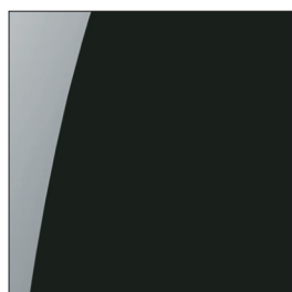
Black High Gloss